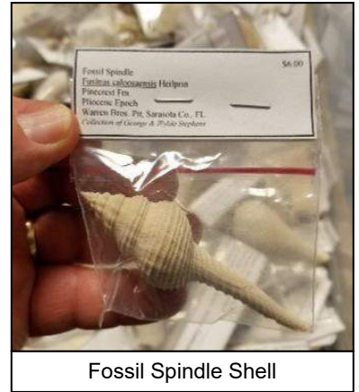
Fossil Spindle Shell