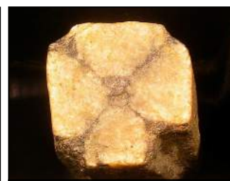
Chiastolite, Moores Flat, Mariposa County, California. Just visible in this specimen is a central light core outlined in black with the arms widening near the outer corners of the crystal. This feathering can make a specimen look like a Maltese cross formed by four light colored arms meeting at a central point. Field of view 16 mm.