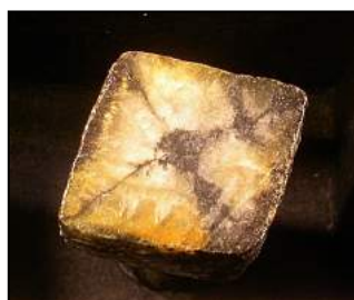
Chiastolite, Blue Wing Mountains, Pershing County, Nevada. The arms spring from a central black core and are thickened a bit by "feathering". Field of view 15 mm.