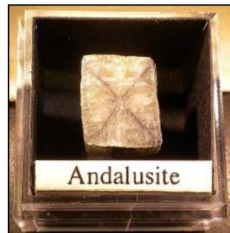
Andalusite var Chiastolite, Lovelock, Pershing County, Nevada. Field of View 25 mm.

Chiastolites are not rare, so there are lots of examples around. You could build a nice subcollection of different types of Chiastolites. Besides being a good show-off in a collection, chiastolite is a good ponder stone when you need a mystery to ponder.