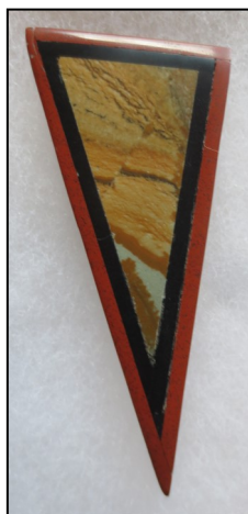
Not My Fault